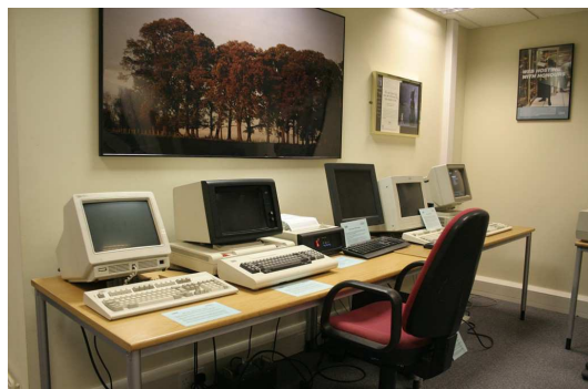
Terminals / Token Ring