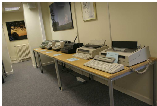
Typewriter / Wheelwriters